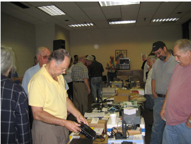
Lot's of Goodies