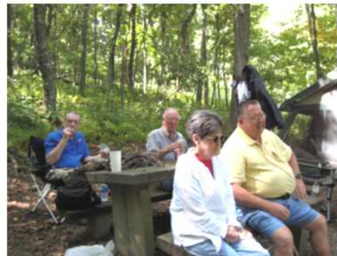
On the Blue Ridge Parkway