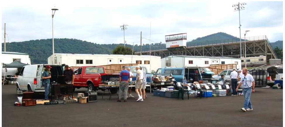
Front row of the outside flea market – a little something for everyone.

With attendance meeting last year's number and more dealers attending than in a while, the Roanoke Valley Amateur Radio Club's W4CA Hamfest proved to be another hit. The wet weather held off and the parking lot re-pavement was completed in time for all the antenna studded cars to find places to park.